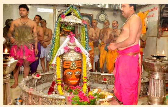
The shivalinga in the garbhagriha of Mahakaleshwar Temple

Harsiddhi Temple: Harsiddhi Temple a major seat of the Shakti sect occupies a special place in the galaxy of temples in Ujjain. Seated between the idols of Mahalaxmi and Mahasarawati. Goddess Annapurna, the main deity worshipped in the temple, is painted a brilliant vermillion.