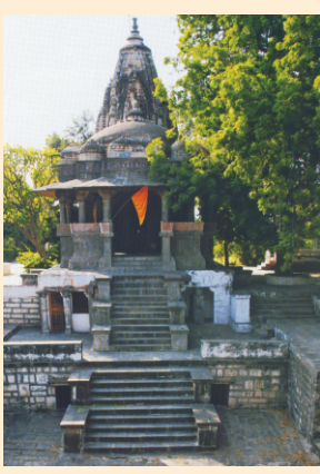
Ram Janardan Temple

Malwa, It is located on the Uijain - Fatehabad road about 2 kms southwest of Mahakal Temple.