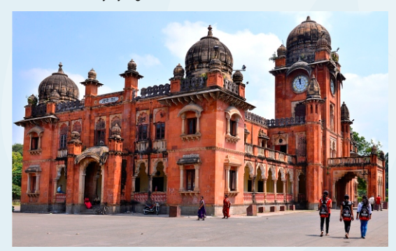
Gandhi Hall, locally also known as Ghanta Ghar

On a hillock near the airport is the temple of Bijasen Mata , built in 1920, and a heritage building that now houses the Border Security Arms Museum. A popular picnic spot, the place offers a breathtaking view of Indore city by night.