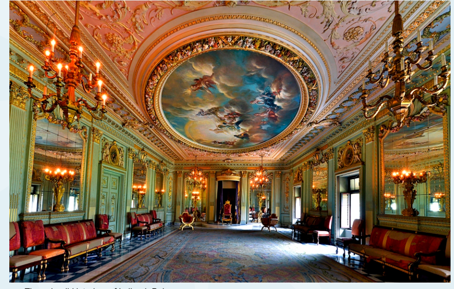
The splendid interiors of Lalbagh Palace

Thing to do : Indore is known for its street food. The Sarafa bazaar is specially famous street food lane. When in Indore breakfast of pohajalebi must be tried.