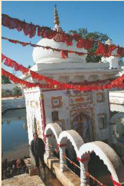
The sanctum in Narmada Udgam Temple

Narmada is considered one of the most sacred rivers of India and pilgrims bathe in its waters to wash away their sins. It is believed that the mere sight of the river is enough to purify oneself! A charming folk tale speaks of the holy Ganga, dressed as a beautiful young woman, visiting Narmada to take a purifying dip in its waters!