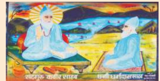
A mural at Kabir Chabutara

A small tank near which the saint Kabir (1440-1518 AD) is said to have meditated, known as Kabir Chabutra , is now a sacred site for the Kabirpanthis.