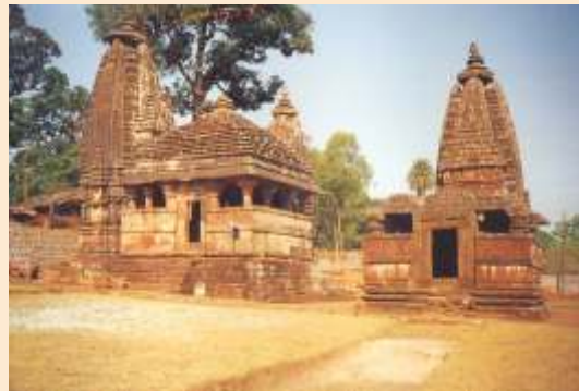
Ancient Temples of Kalachuri period

The small town of Amarkantak has as many as 24 temples. Narmada Udgam , a temple built to mark the source of the Narmada, is considered the holiest place in the town. Facing the Narmada Udgam Temple is the Mata Narmada Temple , a shaktipeeth. Just in front of Narmada Udgam is an open pool called the Narmadakund. South of this kund are ancient temples which were built by the Kalachuri king, Karnadeva (1042-1072 AD). Trimukhi Temple dedicated to Shiva, is the oldest temple in the city, constructed between 1042-1122 AD. There is also an 18th century temple, Keshav Narayan Temple , which was built here by the Bhonsle ruler of Nagpur.